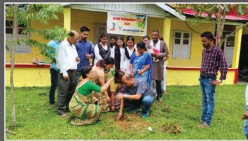
Observed Environment Day at JLC