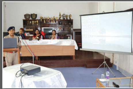
JLC Faculties Delivering Lecture on new Criminal Laws at Assam Police