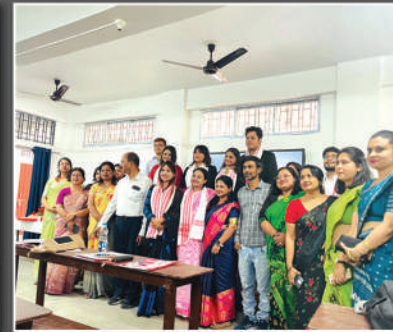
Teachers exchange Programme of JLC with (MoU Partner) AMITY University, Kolkata