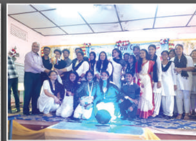
Best Semester award (BA.LL.B(H) 4th Semester) Annual Sports Week 2023-24