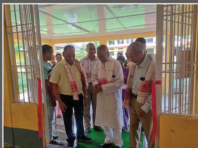
Inauguration of JLC Girls Hostel