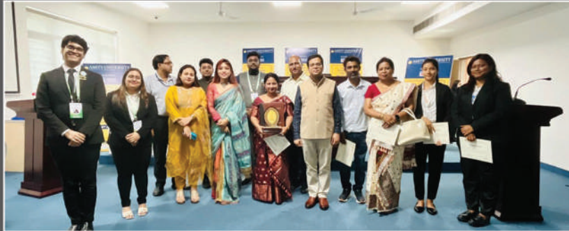
International Conference at AMITY University (MoU Partner), Kolkata