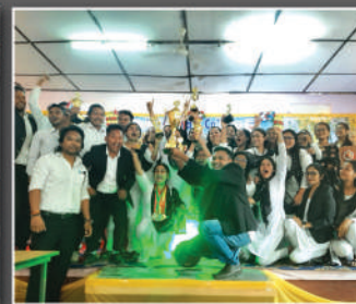
Best Semester award (LLB 2nd Semester) Annual Sports Week 2023-24