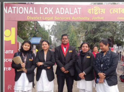
Students at National Lok Adalat