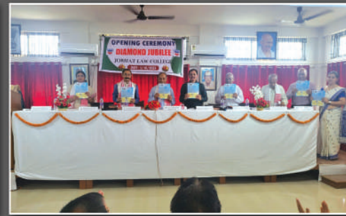
Inauguration of College News Letter